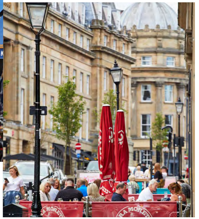
Central Arcade is situated in a prime retail and leisure pitch between Grainger Street and Grey close to Blackett Street and the Eldon Sq Street Shopping Centre.